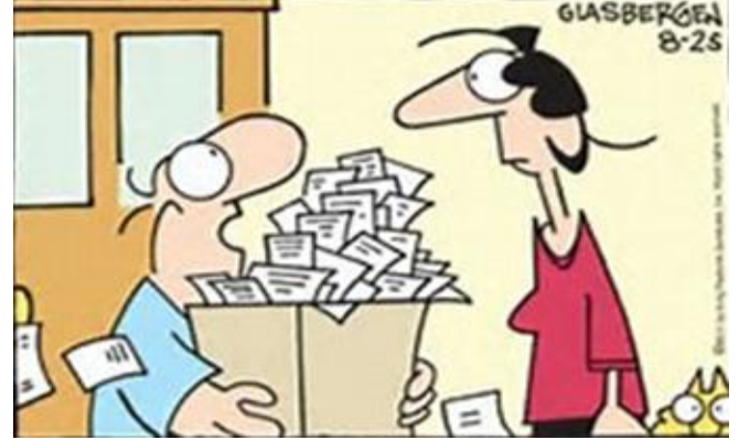
It went pretty well. The auditor took one look at my files and retired.