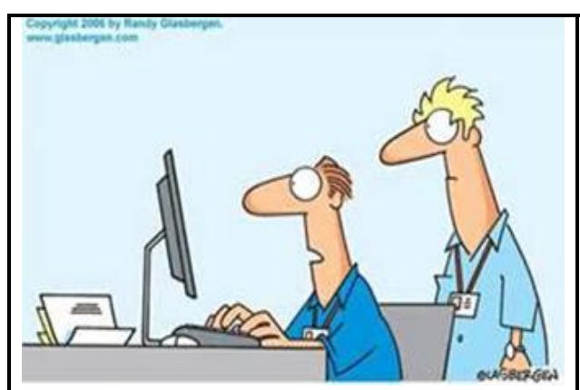
Information security is a major priority at this company. We've done a lot of stupid things we's like to keep secret.