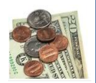
CHAPTER FINANCES Balance Sheet at October 30, 2012