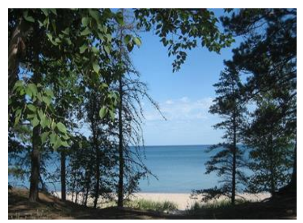
Lake Superior Beach