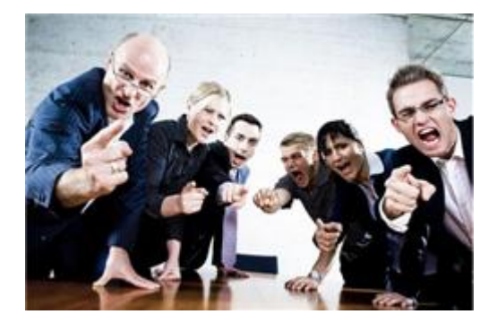
How can you fix a situation like this?

When a group of people with different, roles, ideas and personalities need to work together, there's bound to be conflict. Tempers can flare out of control, and pretty quickly the initial disagreement can become obscured in mistaken meanings and unintended slights.